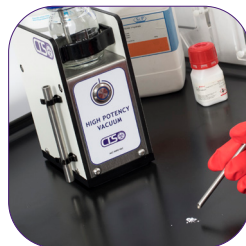
HIPO VAC™ ACC-HIPO-VAC

Potency Powder Vacuum for clean up of powder contamination inside enclosures.