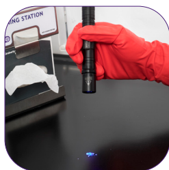
UV CONTAMINATION KIT ACC-UV-KIT

Potency Powder Vacuum for clean up of powder contamination inside enclosures.