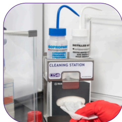
CLEANING STATION ACC-CLEANING STATION

Store cleaning wipes and bottles. Includes: