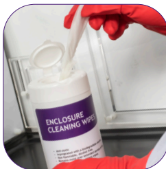
CLEANING WIPES ACC-WIPES-WET