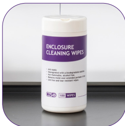
CLEANING WIPES ACC-WIPES-WET