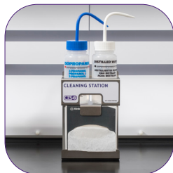
CLEANING STATION ACC-CLEANSTATION

Store cleaning wipes and bottles. Includes: