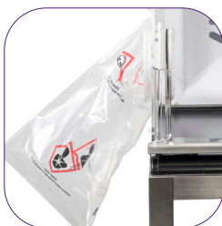
WASTECHUTE ASSEMBLY ACC-WASTE-150-ASM

Wastechute for vented enclosure 150mm ID (Fits all models)