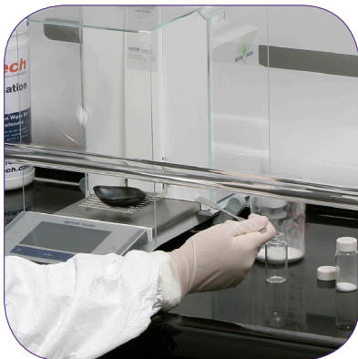
SAFE WEIGHING TECHNIQUES

SWP TRAINING GIVES ANALYSTS THE NECESSARY TOOLS TO DEVELOP SAFE WORK PRACTICE WHEN HANDLING DRUG COMPOUNDS IN THE LABORATORY.